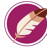
FEATHERS AND DOWN