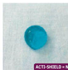
ACTI-SHIELD = NO WATER PENETRATION COTTON FABRIC TREATED ACTI-SHIELD™ Contact angle > 90°