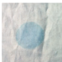
UNTREATED COTTON FABRIC Contact angle < 90°