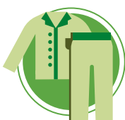
PAJAMAS AND LOUNGEWEA R